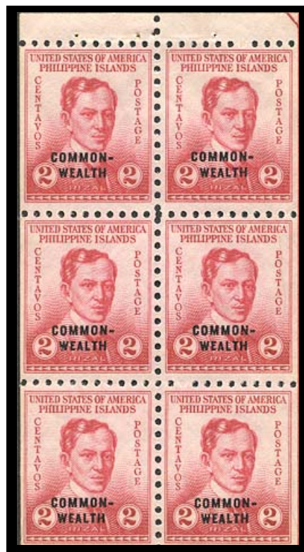
SMALL SIZE COMMON - WEALTH OVERPRINT