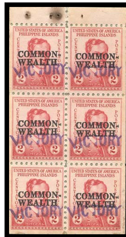
HANDSTAMPED VICTORY Type I IN VIOLET INK