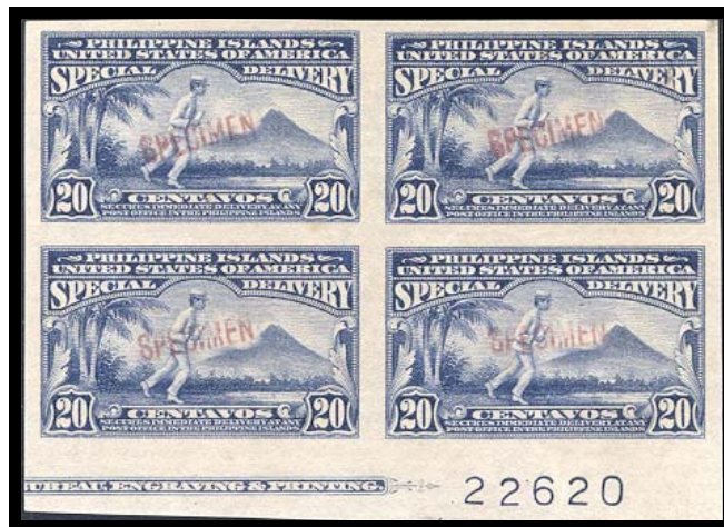
HANDSTAMPED SPECIMEN IN RED INK.