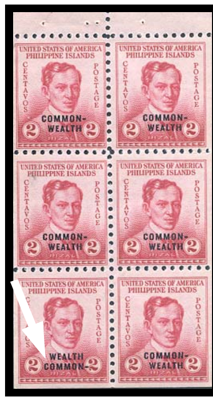
TRANPOSED CLICHÉ ON THE LL STAMP WEALTH ABOVE COMMON -