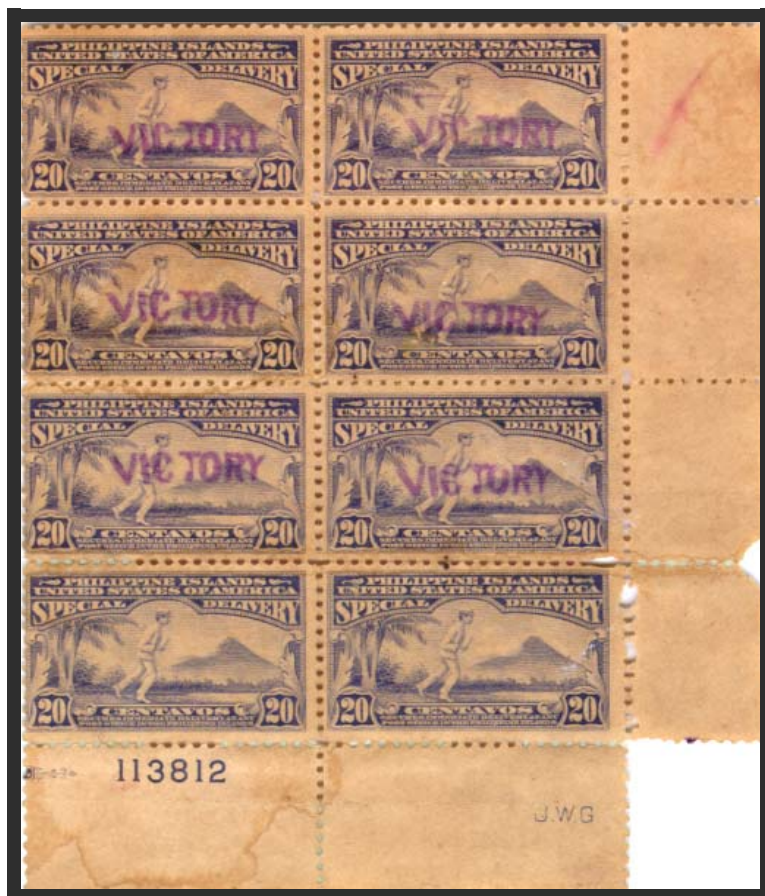
VERTICAL BLOCK OF EIGHT BOTTOM PAIR WITHOUT THE VICTORY HANDSTAMP