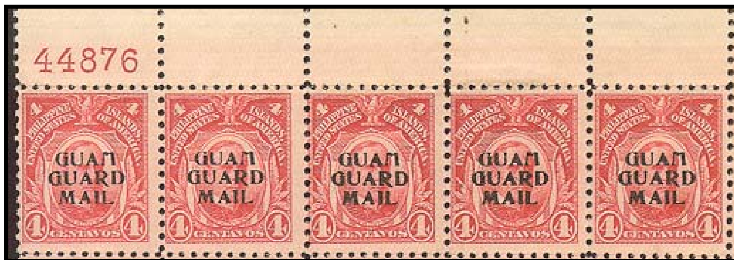
First Issue (April 1930) – Small Size Overprint GUAM GUARD MAIL