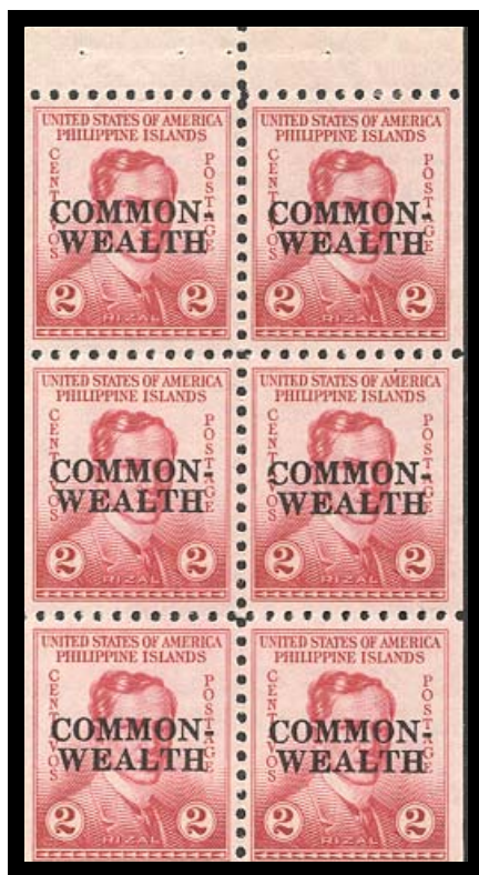
LARGE SIZE COMMON - WEALTH OVERPRINT